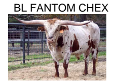
BL FANTOM CHEX