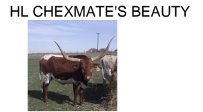
HL CHEXMATE'S BEAUTY