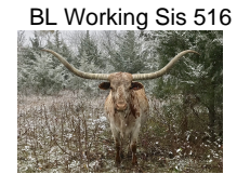
BL Working Sis 516