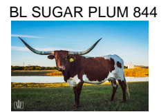
BL SUGAR PLUM 844