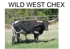
WILD WEST CHEX