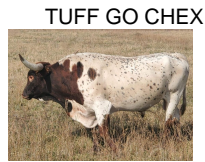
TUFF GO CHEX